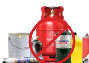
HAZARDOUS MATERIALS OR EXPLOSIVES