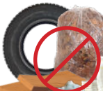
WOOD, WASTE, OR TIRES